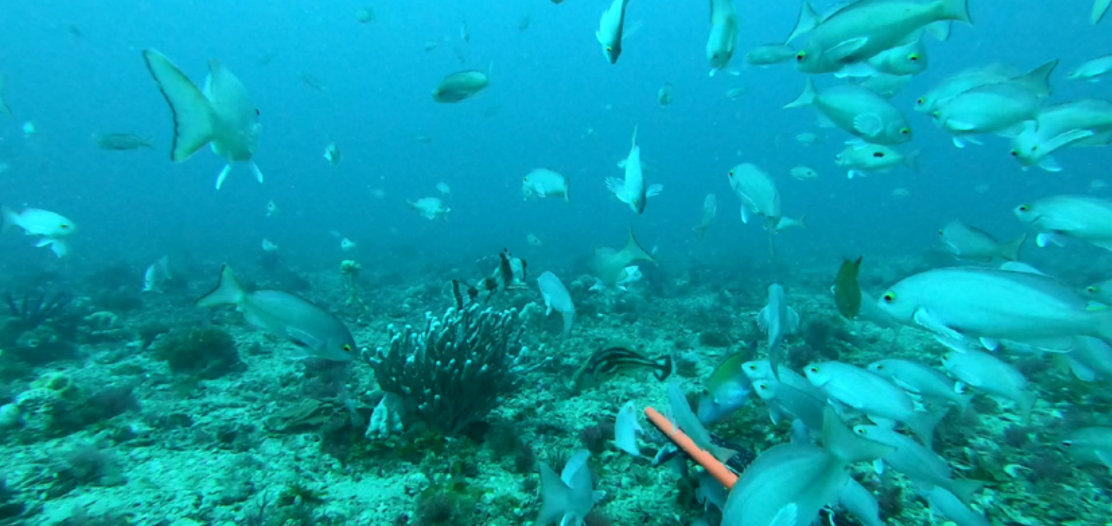
School of perch