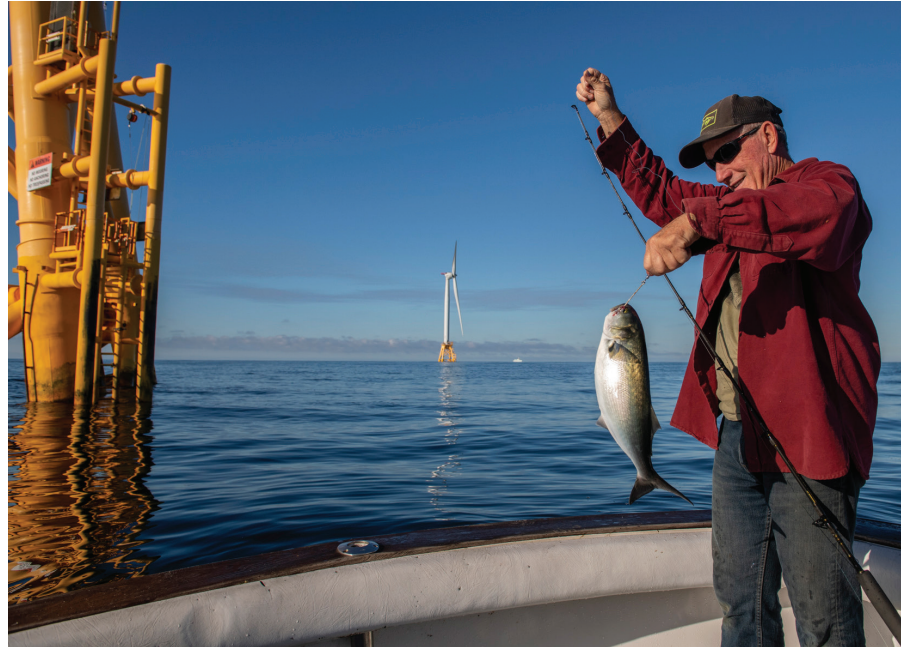
Block Island Offshore Wind Farm, Rhode Island, USA.

A safety buffer will be needed around turbines to protect people and avoid damage to boats and turbines. We'd like to hear from anglers who fish in the area – what do you think a safe distance is?