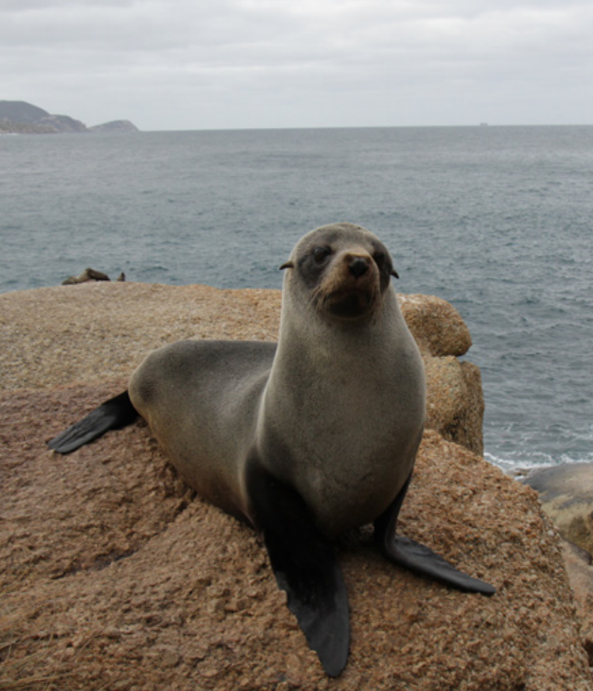
New Zealand fur seal