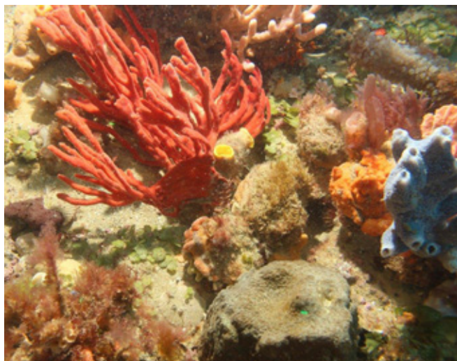
Reef and colourful invertebrates from just outside the project area 35 m underwater

Subject matter experts are collecting, verifying and analysing the data. Findings will be publicly available through the project's assessment and approvals process over the coming years.