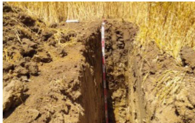
Example test pit site