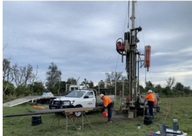
Example drill rig